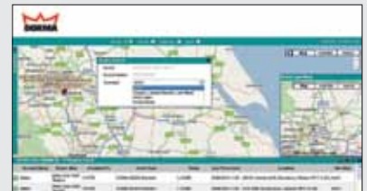
Fault diagnosed, door controlled remotely offering immediate response