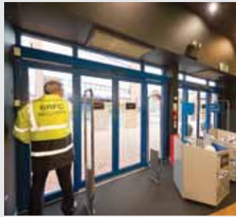
A fault with your door could lead to customer dissatisfaction and loss of revenue

DORVISION allows you to access this information through the internet. You can monitor the performance of the doors and determine footfall trends through the doors. With DORVISION you will always be ready for business.