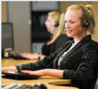
DORMA Service team notified and response type decided