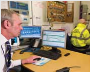
Data captured by DORVISION