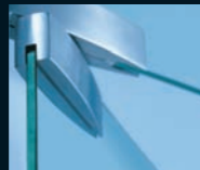
Glass Fittings and Accessories